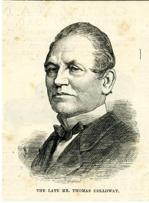
THE LATE MR. THOMAS HOLLOWAY.