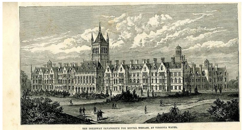
THE HOLLOWAY SANATORIUM FOR MENTAL DISEASE, AT VIRGINIA WATER.